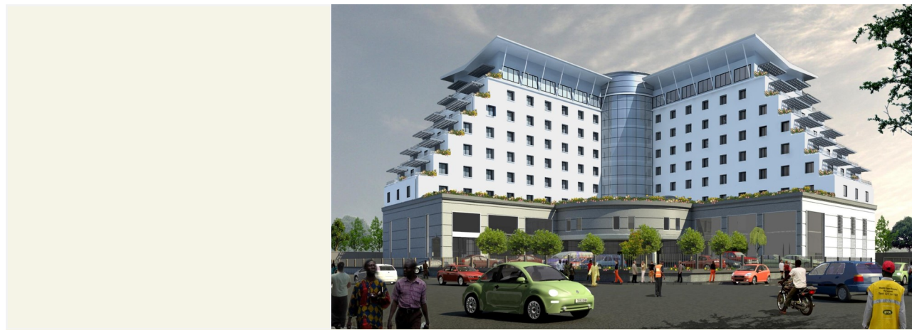
Four Points by Sheraton Lagos Plot 9/10 Block 2 Oniru Chieftaincy Estate, Victoria Island, Lagos Nigeria